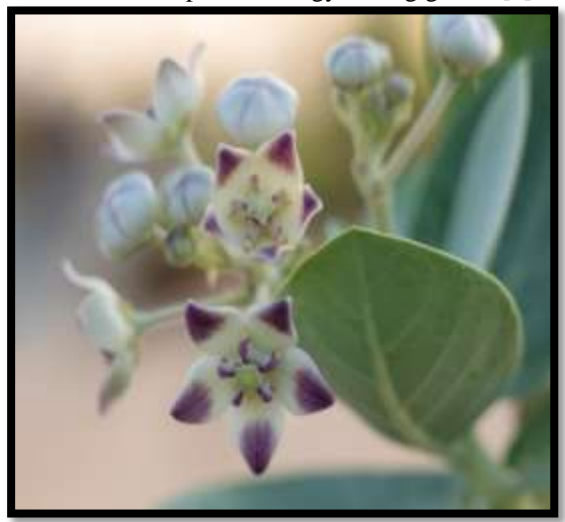
Fig .1: Calotropis Gigantea plant [15].

Medicinal plants are major source of the traditional medicine in India. India is considered as "Botanical Garden of World". A large segment of Indian population use medicinal plants for their health security. India has 15 agroclimatic zones and 17000-18000 species of flowering plants of which 6000-7000 are estimated to have medicinal usage in traditional systems of medicines (Anonymous, 2015). The Medicinal and Aromatic Plants contain a large number of chemical constituents which are the major source of therapeutic agents to cure human discomfort. The World Health Organization has also recognized the role of traditional systems of medicine, which depend largely upon the medicinal plants. The use of Medicinal and Aromatic Plants throughout the world has been increasing by the rate of 7-15 % annually. Calotropis gigantea (L.) Dry and is one of such plants, which has long tradition of use in various systems of medicine. Thus, a review has been compiled on ethnopharmacological uses, chemical constituents and pharmacology of C. gigantea [4]